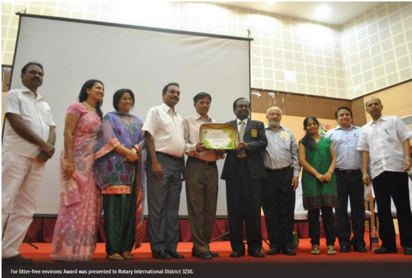
For litter-free environs: Award was presented to Rotary International District 3230.